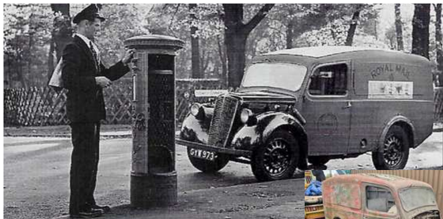
A 1945 Y type postal van, GYW 973, photographed on Dulwich Common, which worked for the Post Office from May 1946 to August 1960.